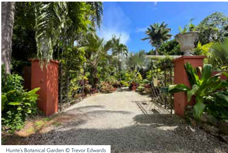
Hunte's Botanical Garden

At 21 miles long and 14 miles wide, Barbados is a small and perfectly formed vision of pure Caribbean paradise. This is a place of upbeat welcomes, radiant seas, sandy beaches, golden palms, and thick gleaming rainforest – the quintessential island idyll. It's also a place where private gardens blossom, lilies and heliconias burst vibrantly out of the undergrowth, and species of orchid thrive in their thousands. This laid-back tour really does have something for everyone. Picture gazing across the sweeping vistas of Cherry Tree Hill, watching the lively resident monkeys of the Andromeda Botanical Garden and exploring the George Washington House, an important remnant of the island's plantation past. Join us as we escape the bustle of mainland life, and channel your inner castaway.