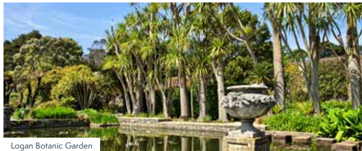
Logan Botanic Garden

Day 2 We begin with a visit to the lavishly planted Glenwhan Garden , with marvellous views over Luce Bay. At its heart is an extensive pool, divided by a grassy causeway and fed by a tumbling stream. This afternoon we explore the world-famous Logan Botanic Gardens . The gardens are beautifully laid out, particularly in the walled garden with its fine terraces and well-planned borders under an avenue of cabbage palms. The climate here is exceptionally mild and several different habitats provide conditions for a huge range of plants. (B, D)