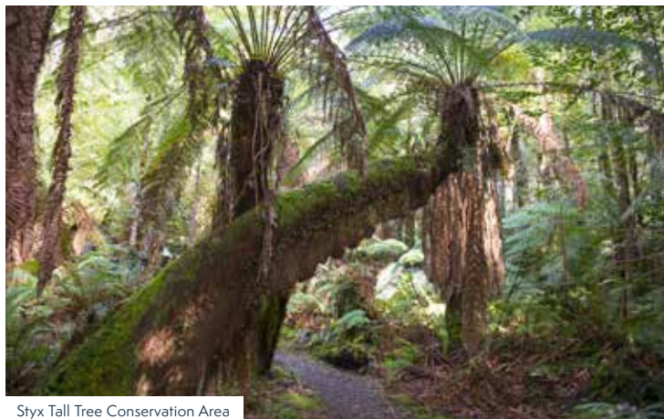
Styx Tall Tree Conservation Area

Selecting the very best places to visit, while reluctantly discarding others, we have whittled this down to just under three weeks, and a tour that we think will provide the opportunity to experience a broad cross-section of beautifully landscaped and lavishly planted gardens as well as native flora, and a truly unforgettable holiday experience.