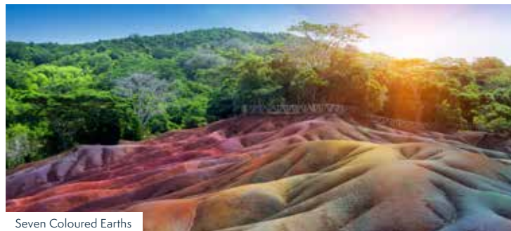
Seven Coloured Earths