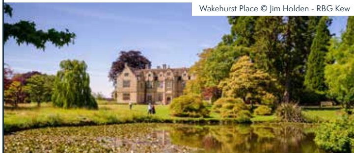
Wakehurst Place