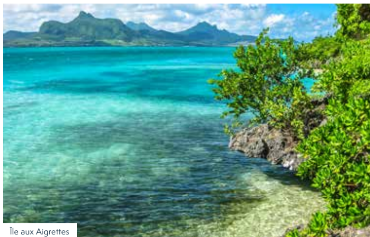
Île aux Aigrettes

The Indian Ocean island of Mauritius is only the size of the county of Surrey, yet it is blessed with a rich and diverse flora and fauna, and is home to some of the rarest plants and creatures in the world. Caressed by a benign climate and light but regular rainfall, virgin forests and coastal lands provide ideal habitats for myriad species, many of them unique to the island – of the 1,000 or so plants indigenous to Mauritius, about 300 are totally unique. Our exploration will reveal trees that will be the last of their kind in existence, giant waterlilies, and colourful Cannas and Heliconias. We will witness outstanding conservation work with almost extinct plants and animals and there will also be plenty of time to enjoy the facilities of our resort hotel, the white sandy beaches and turquoise waters, and soak up the local culture, with its unique combination of European, Indian and African influences.