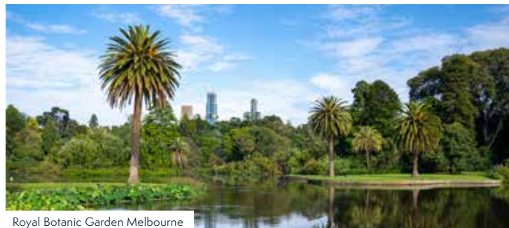
Royal Botanic Garden Melbourne