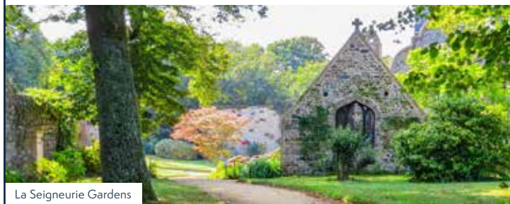
La Seigneurie Gardens