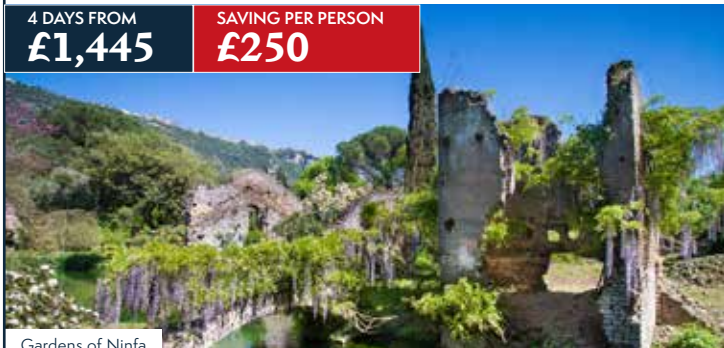
Gardens of Ninfa

Open by special arrangement, we are delighted to offer this rare opportunity to visit the beautiful gardens of Ninfa. The romantic flower covered ruins are as close to gardening perfection as you can get. Scented roses, hydrangeas and jasmines curtain what remains of the walls of medieval buildings and paths meander beside a crystal-clear river. We also have the opportunity to follow in the footsteps of the Popes as we explore the gardens of Castel Gandolfo. We also visit Villa Lante, a study in geometry and symmetry, and tour the 16th century gardens at Villa D'Este, romantically overgrown with tall pines, evergreen oaks and cedars.