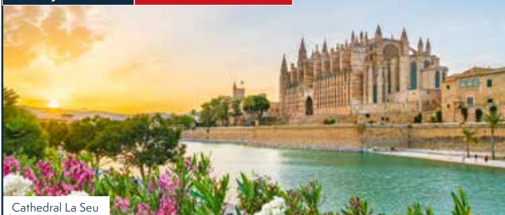
Cathedral La Seu

Away from the busy beach resorts, the Balearic island of Mallorca offers a timeless, verdant landscape of wooded hills and orange groves, sweeping bays and rocky mountains. Dotted around the island is a host of historic gardens whose origins date back hundreds of years, as well as more modern creations, providing a rich range of horticultural delights. These include the gardens at Raixa and Alfaiba, both with Moorish origins and later Christian influences, and Son Marroig, a former residence of Archduke Luis Salvador with dramatic views. We also tour the island's principal city of Palma and take an exhilarating ride on the scenic Tren de Soller, a heritage train.