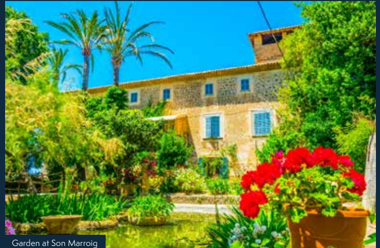
Garden at Son Marroig