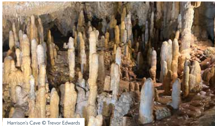
Harrison's Cave