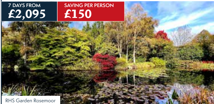
RHS Garden Rosemoor