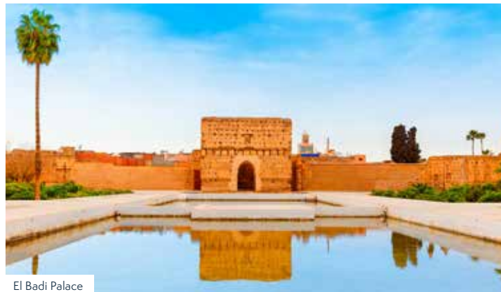
El Badi Palace