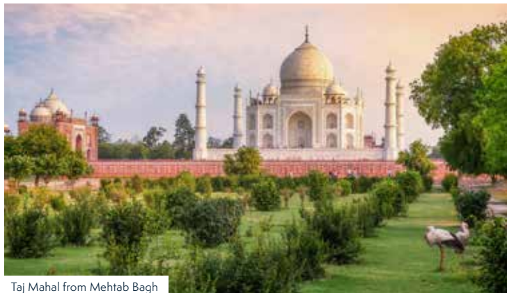
Taj Mahal from Mehtab Bagh

Prepare for an assault on the senses as we plunge into the vibrant, chaotic, other-world that is India. In Delhi, the teeming capital city, we see contrasts of old and new, with visits to Humayun's Tomb and the museum dedicated to Mahatma Gandhi, followed by a stimulating day that features the Garden of the Five Senses. Continuing by train to Agra we visit the Red Fort and, of course, the Taj Mahal - enjoying stunning views at both sunset and sunrise. We discover the Abhaneri stepwell before continuing to Jaipur, where we tour the impressive Amber Fort and visit the elegant gardens of the Rambagh and Sisodia Palaces. Moving on to Jodhpur we enjoy walks through the bustling bazaars and markets and explore the charming Mandore Gardens with a variety of flora and some chattering monkeys. We conclude in Udaipur, where we see an incredible Hindu temple and the treasures of the Jagmandir Island Palace. We also offer the option to extend your stay in either Shimla or Amritsar.