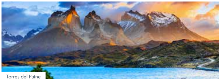
Torres del Paine

We begin in the Chilean capital, Santiago, a huge city of shining skyscrapers and beautiful parks. We tour the National Park of La Campana (in the footsteps of Charles Darwin) before flying south to Punta Arenas and the Torres del Paine National Park. Two full days are set aside to do justice to the extraordinary range of plants, birds and animals to be found here in the magnificent desolation of Patagonia, and we have also included a boat trip on Lake Grey and the Grey Glacier. We then fly from Punta Arenas to the Falkland Islands, situated 400 miles off the coast of South America in the South Atlantic Ocean. The Falklands offer fresh air, big skies and an abundance of wildlife, much of which is very tame and approachable – we will discover that the penguins have no hesitation in coming up to investigate visitors! There are also elephant seals, sea lions and albatross amongst other birds and animals and in the course of our stay we will visit several different islands providing endless photo opportunities and an unforgettable experience of life on these unspoilt and proudly British islands. Truly a trip of a lifetime!