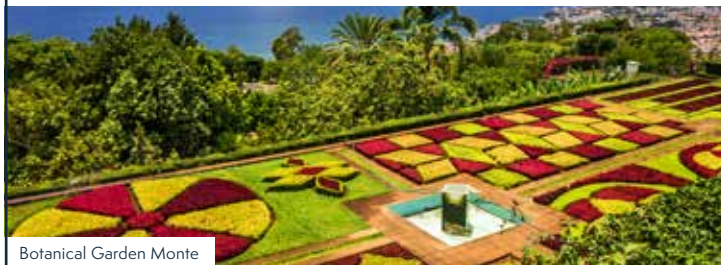
Botanical Garden Monte