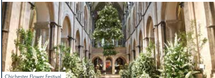
Chichester Flower Festival