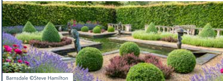
Barnsdale