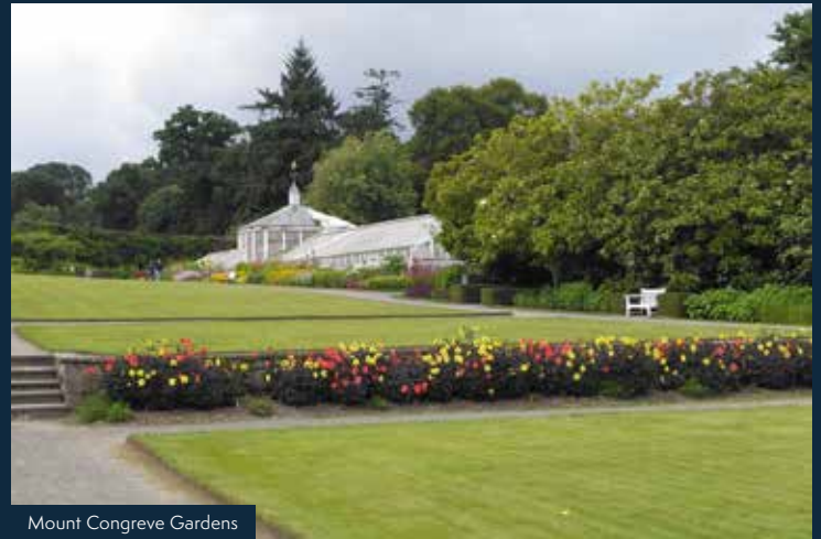
Mount Congreve Gardens