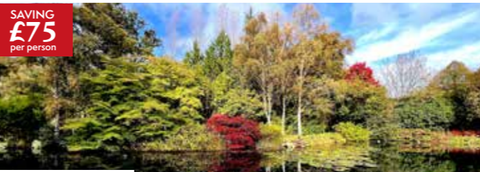
RHS Garden Rosemoor