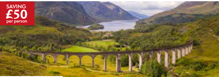
The Jacobite steam train