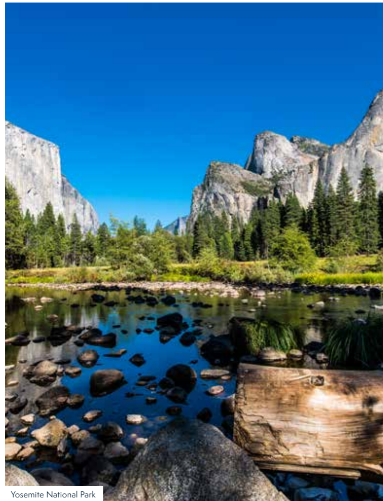
Yosemite National Park