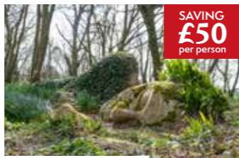
Lost Gardens of Heligan