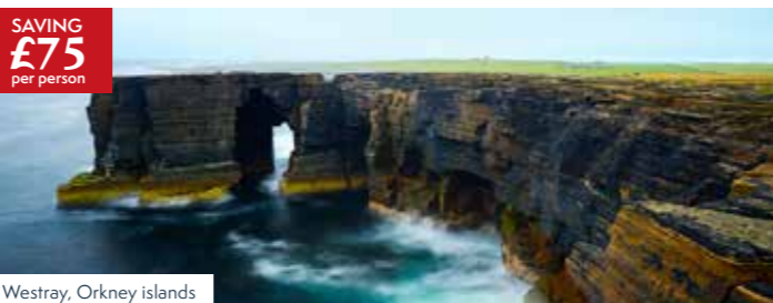
Westray, Orkney islands