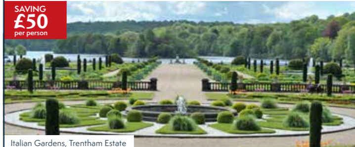
Italian Gardens, Trentham Estate