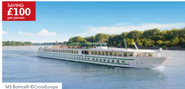
MS Botticelli

Inc. meals: B: Breakfast, L: Lunch, PL: Packed Lunch, D: Dinner