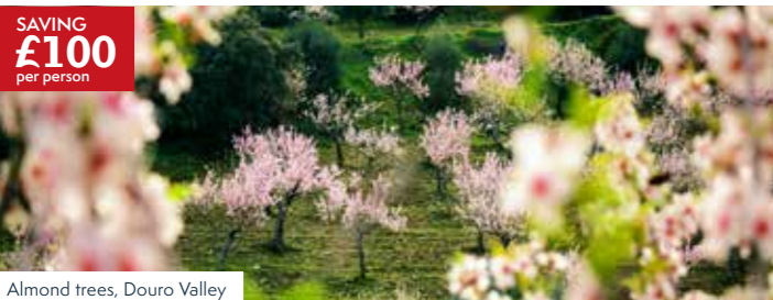
Almond trees, Douro Valley