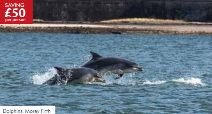
Dolphins, Moray Firth