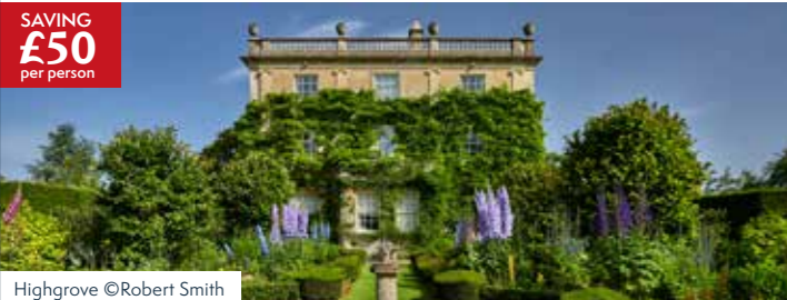
Highgrove