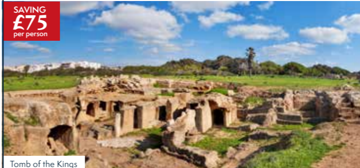
Tomb of the Kings