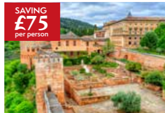
Alhambra Palace and garden