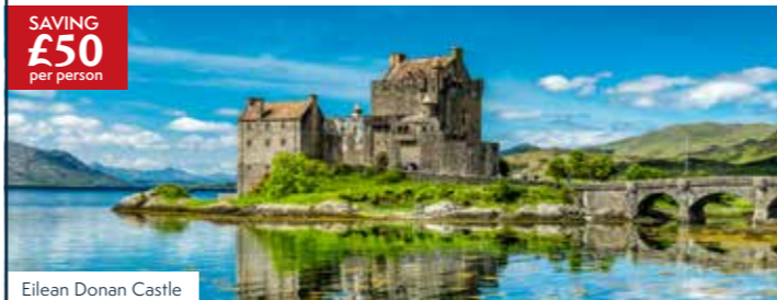
Eilean Donan Castle