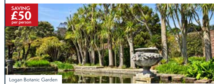
Logan Botanic Garden