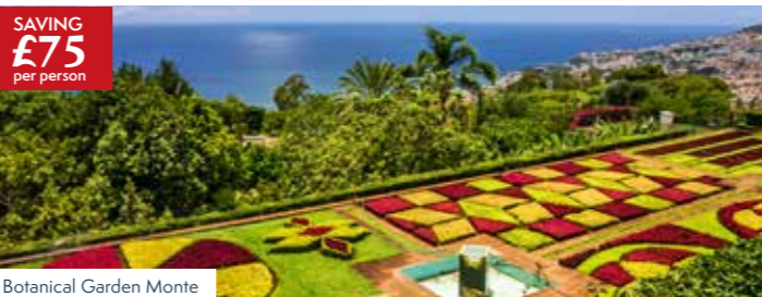
Botanical Garden Monte