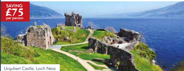
Urquhart Castle, Loch Ness