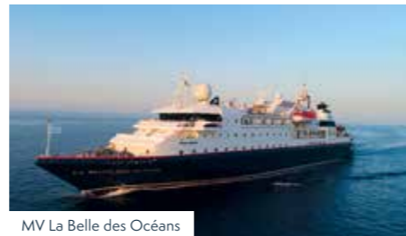
MV La Belle des Océans

Day 1 We depart from London to Nice where we transfer to the ship. The remainder of the afternoon is spent at leisure. (D)