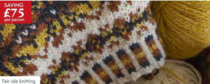
Fair isle knitting