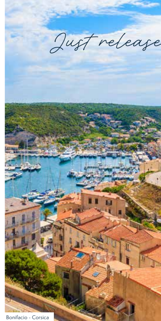
Bonifacio - Corsica

Embark the elegant MV La Belle des Océans in the glitzy French Riviera and set sail for the island of Corsica. Birthplace of Napoleon Bonaparte, the island is home to a National Museum dedicated to the family history. Elsewhere we explore the Corsican underbrush, visit a honey farm and the gardens of U Giardinu di l'Isuli. See p22