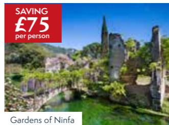
Gardens of Ninfa