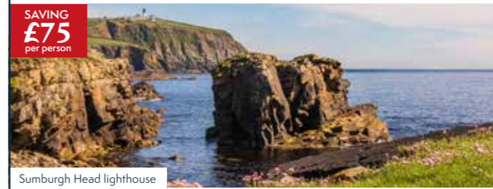
Sumburgh Head lighthouse