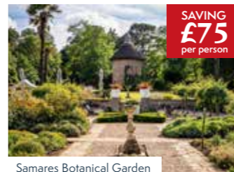
Samarès Botanic Garden