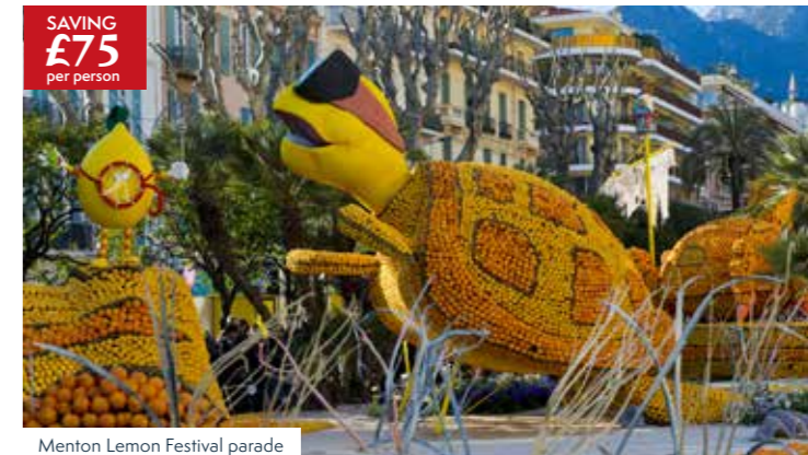
Menton Lemon Festival parade

Inc. meals: B: Breakfast, L: Lunch, D: Dinner