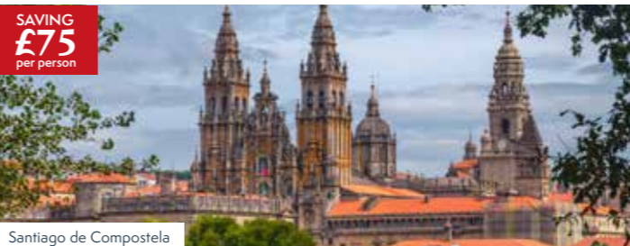
Santiago de Compostela