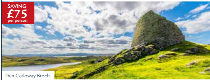
Dun Carloway Broch