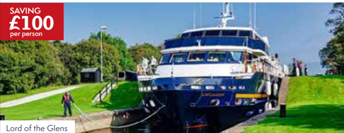
Lord of the Glens