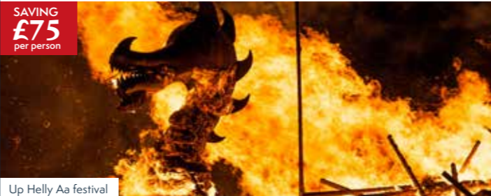
Up Helly Aa festival