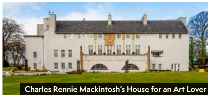
Charles Rennie Mackintosh's House for an Art Lover