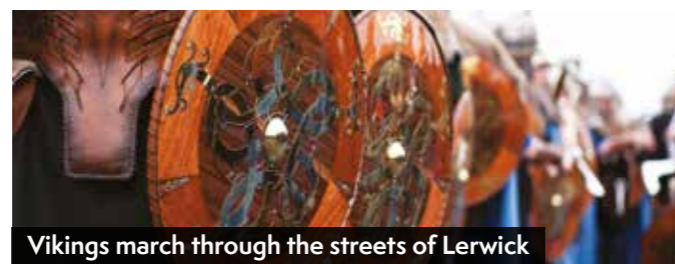
Vikings march through the streets of Lerwick

Shetland is a beguiling place to visit at any time but in the short winter days the islands take on a special character with steely grey seas and dramatic skies. During our stay we will take in the prehistoric and Norse settlement of Jarlshof to the south, and tour as far as the islands of Yell and Unst to the north. Up Helly Aa itself is on the Tuesday, when we will have the day free to enjoy the various events in Lerwick, culminating in the torchlight procession and boat burning ceremony in the evening, the highlight of an unusual and uplifting winter break.