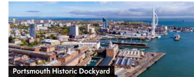
Portsmouth Historic Dockyard