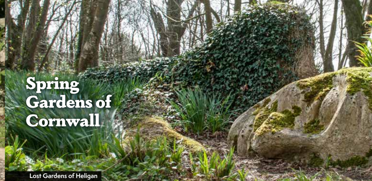
Lost Gardens of Heligan

Spring comes early in Cornwall, as trees, shrubs and bulbs bring life and colour back to the gardens. The near neighbours of Trebah and Glendurgan illustrate this perfectly, with the great Asiatic shrubs of rhododendron, magnolia and camellia all featuring rich blossom. The award-winning Lost Gardens of Heligan continue to fascinate, while over at the Eden Project things have come a long way since that disused chalk pit was transformed into a futuristic microcosm of botanical diversity. Our tour is bookended with visits to two top-class National Trust properties at Knightshayes Court and Killerton.