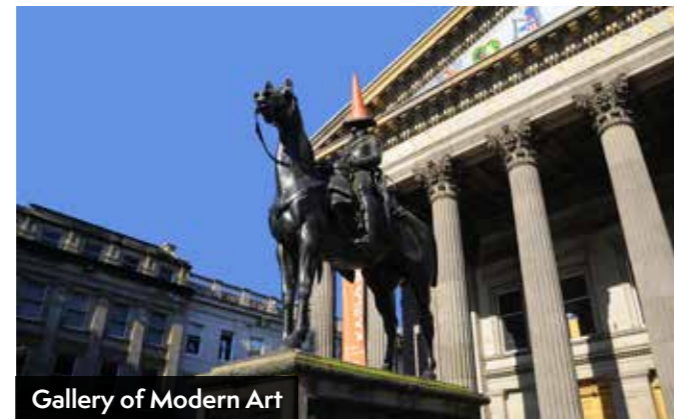
Gallery of Modern Art

Re-opened in March 2022 after an ambitious refurbishment, Glasgow's Burrell Collection allows visitors for the first time to explore all three floors in the building, set out as galleries, visible stores and special exhibition spaces. This incredible collection holds treasures from all over the world, including 5,000-year-old porcelain from China, paintings by renowned French artists including Manet, Cézanne and Degas, and medieval artefacts such as stained glass, armour and tapestries. Our tour includes visits to the Kelvingrove Art Gallery and Museum, where notable works of art from across Britain and Europe are featured alongside a diverse collection of exhibits; the Hunterian, Scotland's oldest public museum, the Gallery of Modern Art located in the centre of Glasgow, Holmwood House and the House for an Art Lover, built in the 1990s to a design by Charles Rennie Mackintosh from 1901.