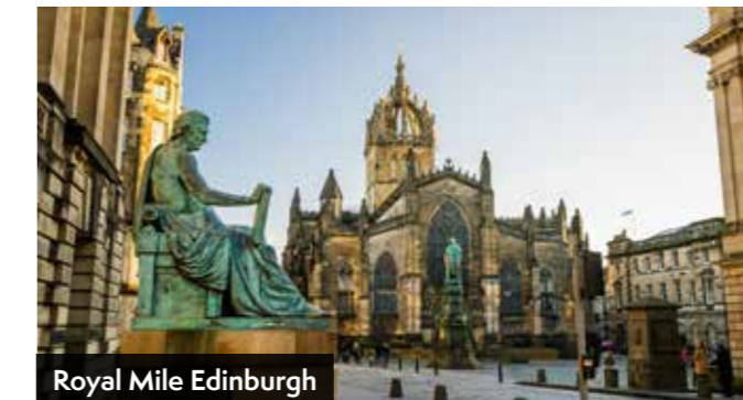
Royal Mile Edinburgh