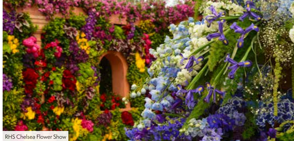
RHS Chelsea Flower Show