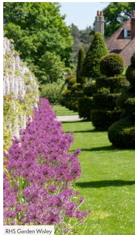
RHS Garden Wisley

Dining: Breakfast & farewell gala dinner RHS Wisley