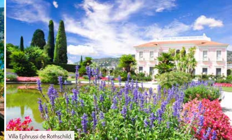
Villa Ephrussi de Rothschild.

On arrival we travel to the world-famous, UNESCO World Heritage listed Royal Botanic Kew Gardens .