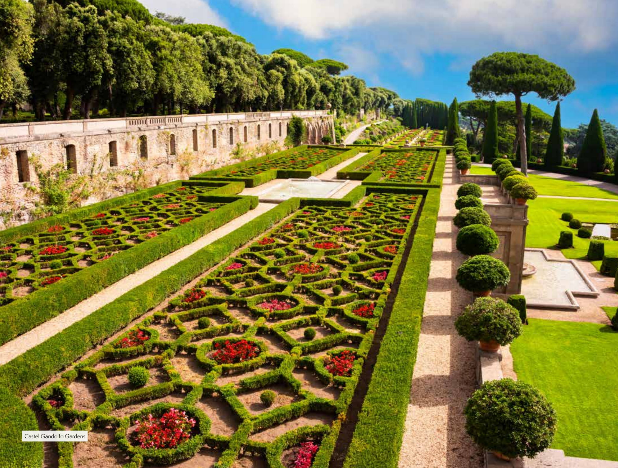
Castel Gandolfo Gardens