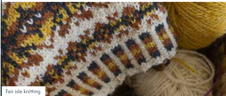
Fair isle knitting