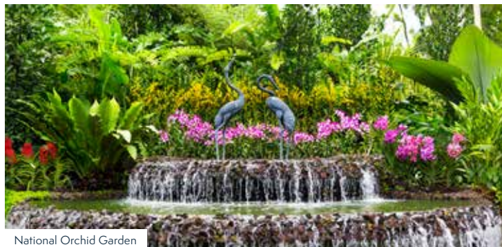
National Orchid Garden

Inc. meals: IF: In flight, B: Breakfast, AT: Afternoon Tea, D: Dinner