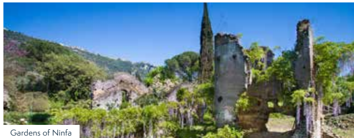
Gardens of Ninfa

Day 2 After breakfast we depart for Viterbo , where we have a guided tour. We'll see a number of grand palaces and a host of old churches which are enclosed by an intact set of medieval walls. Nearby, we find the gardens of Villa Lante , described as "one of Italy's greatest Renaissance gardens." This study in geometry and symmetry dates back to 1568 when it was designed for Cardinal Gianfrancesco Gambara by the architect Giacomo Barozzi da Vignola. The dominant theme is water, and in front of the palazzina is a central water parterre, which is a classic example of late Renaissance or mannerist style. A later addition is the ornate French-style parterre de broderie, with intricate shapes in clipped box set against a ground cover of reddish gravel. (B)