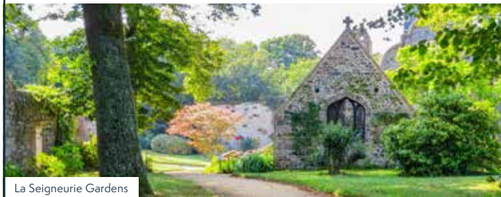
La Seigneurie Gardens