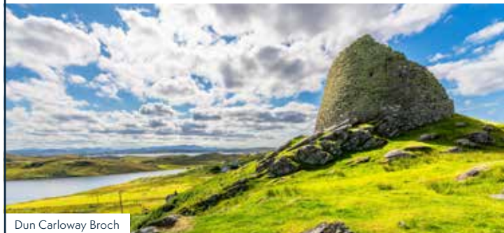
Dun Carloway Broch