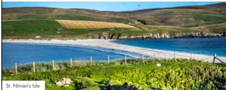
St. Ninian's Isle