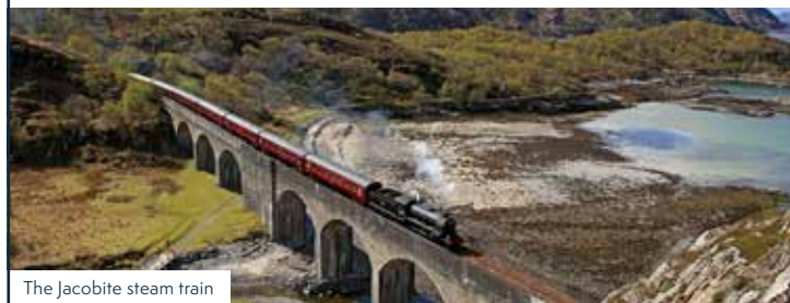
The Jacobite steam train