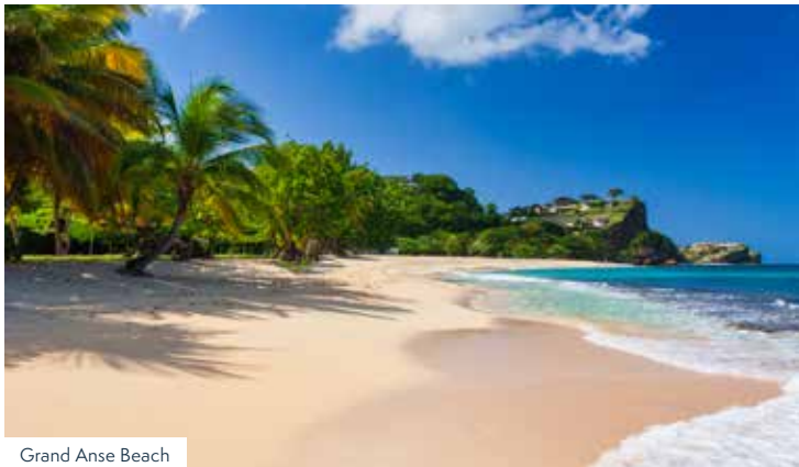
Grand Anse Beach

Given that Grenada won the President's Choice Award at the 2024 Chelsea Flower Show, it's reasonable to assume that people here know a thing or two about gardening, and we can expect some real treats as we visit a host of gardens. We are based at the Blue Horizons Garden Resort, set back 300 yards from Grand Anse Beach, which provides accommodation in self-contained one-bedroom units offering both comfort and privacy. The grounds are extensive and merit a guided tour in their own right, as well as a bird-watching tour.