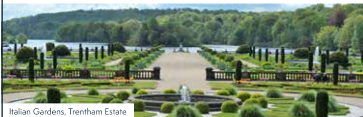
Italian Gardens, Trentham Estate