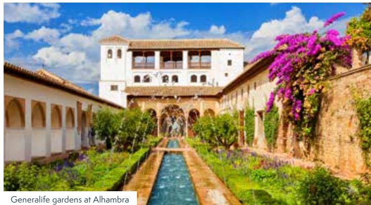
Generalife gardens at Alhambra

Day 5 The whole day is spent in Seville , with visits to the Maria-Luisa Park , the Plaza de España , the Gardens of Murillo and Seville's majestic Cathedral . (B)