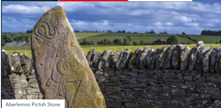
Aberlemno Pictish Stone

Living beyond the northern frontier of the Roman Empire, the people of northern Scotland in the Dark Ages were known as the Picts – a name given by the Romans meaning the ‘painted, tattooed ones’. They were renowned as one of the most warlike of the Celtic barbarian tribes of Europe, successfully attacking the Roman army, and yet few of their homes or forts have ever been found. They did, however, leave behind some of the finest carved stones and jewellery from early medieval Europe.