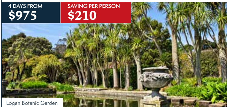
Logan Botanic Garden

In the south-western corner of Scotland, Dumfries and Galloway is home to some of the country's most attractive gardens. For many the highlight of our tour is undoubtedly Dumfries House, actually in Ayrshire, which King Charles helped to save. One of the Adam brothers' finest achievements, the stunning interiors showcase a unique collection of Chippendale furniture, while the walled garden is one of the most exciting new garden developments in Scotland. Other highlights include exotic plants at Logan Botanic Gardens, Glenwhan Gardens with its hilltop vistas and Drumlanrig Castle with its extensive gardens and world-class collection of fine art.