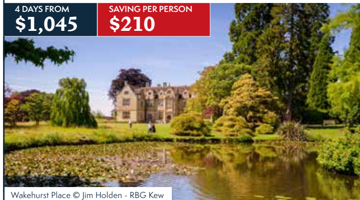
Wakehurst Place

If there's one tour that epitomises the joy of strolling around a perfect English country garden, it is this one – with one shining example after another to be savoured and enjoyed. Even if you have visited some of these properties before, such is their allure that you can return again and again, just as you would re-read your favourite novel. First-time visitors will be bowled over by the quality and pedigree of these gardens, which capture the essence of the English country garden. Visits include Great Comp, Lullingstone Castle and its World Garden of Plants, Nymans Garden, the Sussex Prairie Garden, Sissinghurst, Great Dixter and RHS Garden Wisley.