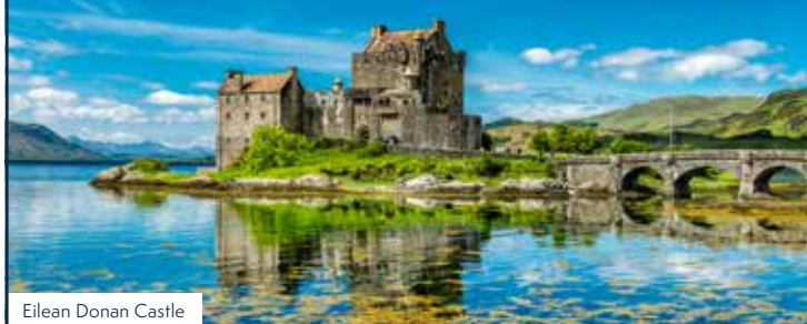
Eilean Donan Castle

The north of Scotland is blessed with some wonderfully scenic railway lines. The challenge of building railways through difficult terrain was taken up by the great engineers of the Victorian age. Their legacy is in the sweeping curves and majestic viaducts of the single track lines which cross wild moors and lonely glens. Highlights on this short break include a visit to the much-photographed Eilean Donan Castle, a ride aboard the Jacobite steam train that takes us over the iconic Glenfinnan Viaduct and a rail journey on the Highland Line that provides some magnificent views and takes us over the Drumochter Pass, 1,480 feet above sea level.