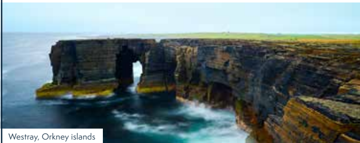
Westray, Orkney islands